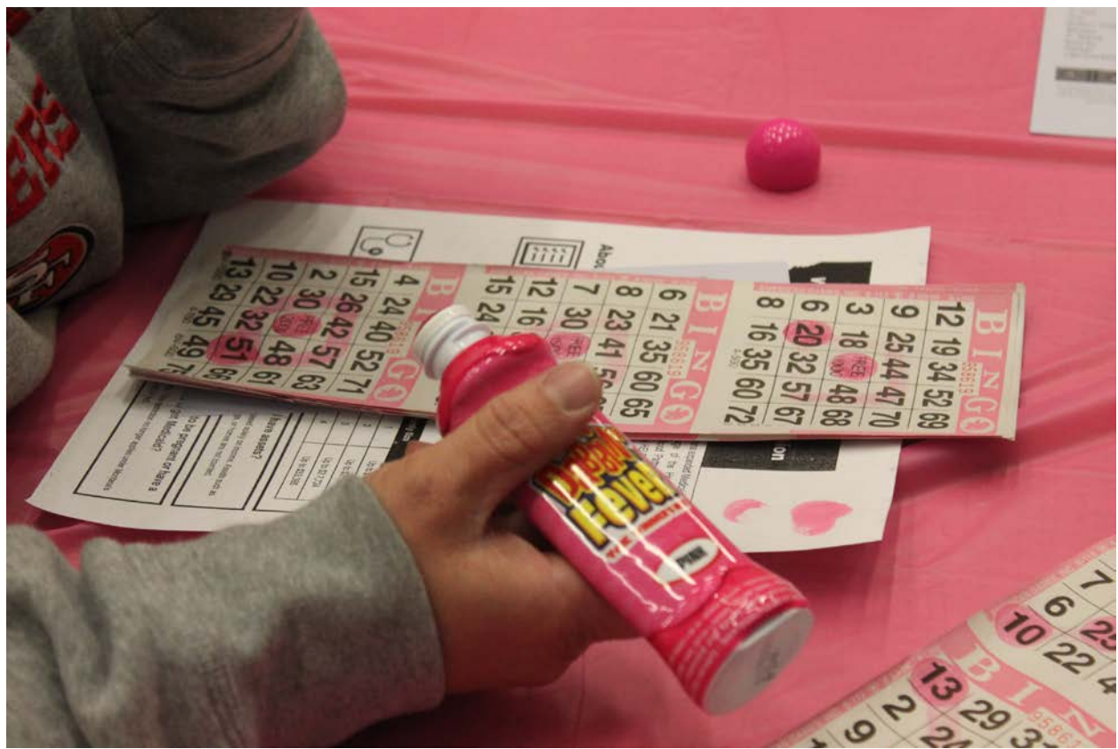
Photo File Name: Bingo card IMG_7688 Photo Caption (include the name of the event/persons, location, and date): May 10, 2016. Pink Bingo at MSUB combines cancer awareness, fellowship, and fun.