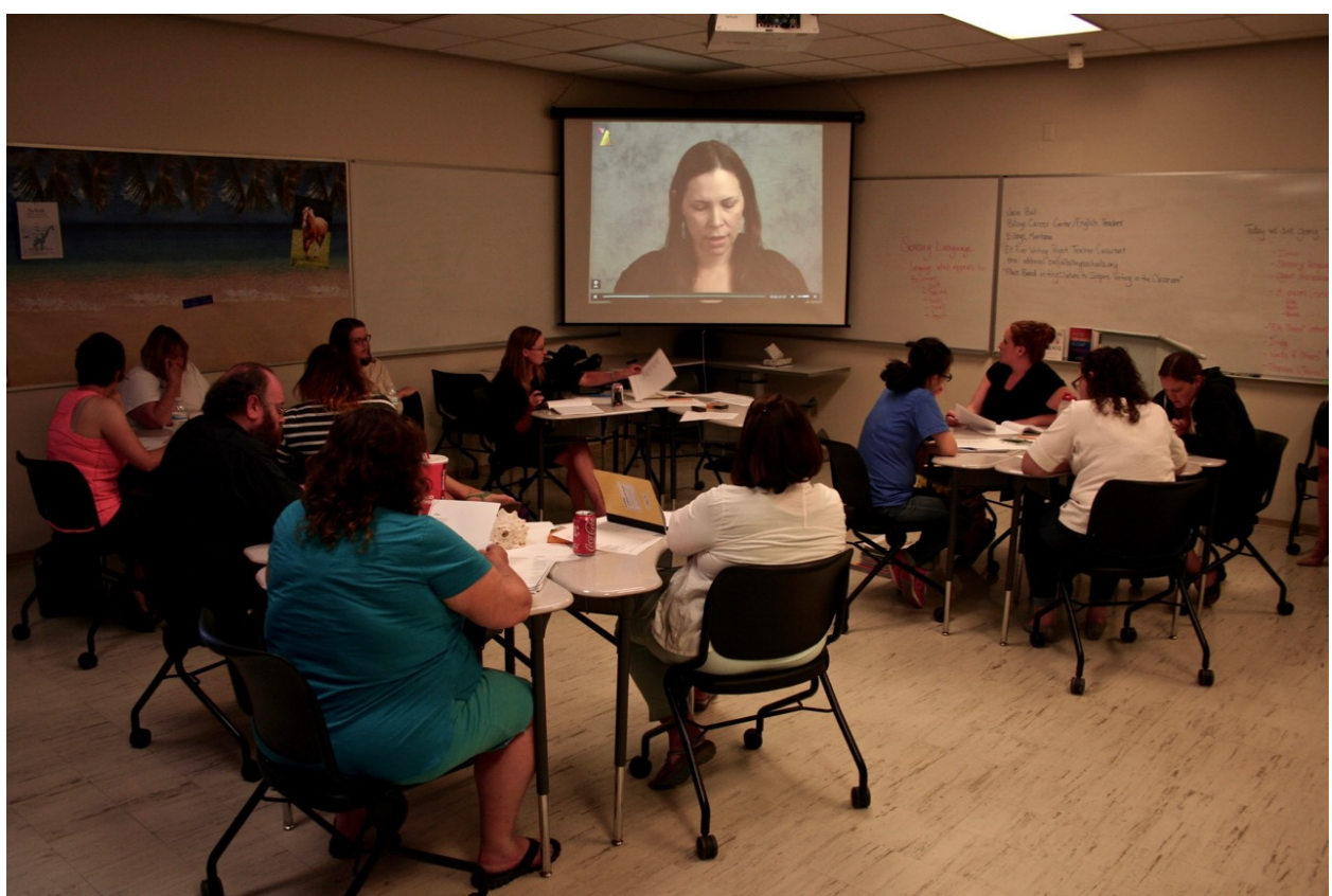
Photo File Name: Class Work Cahoon Poetry Photo Caption (include the name of the event/persons, location, and date): 2016 Elk River Writing Project. Summer Institute at MSUB